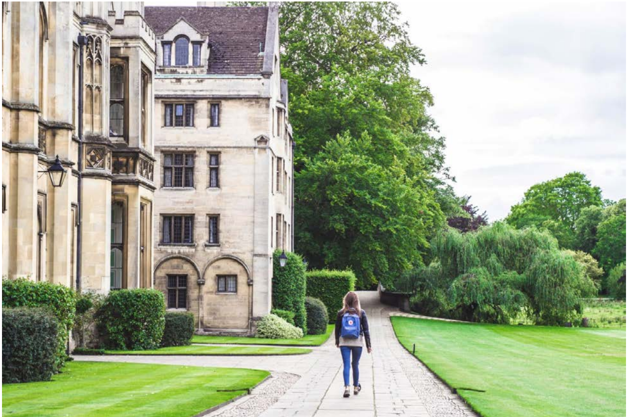
ABOVE PrepWorks' Virtual Boarding School Fair will allow prospective parents to learn more about UK boarding schools and the benefits of sending their children to study there

Don't miss: Top 10 most powerful passports in 2024