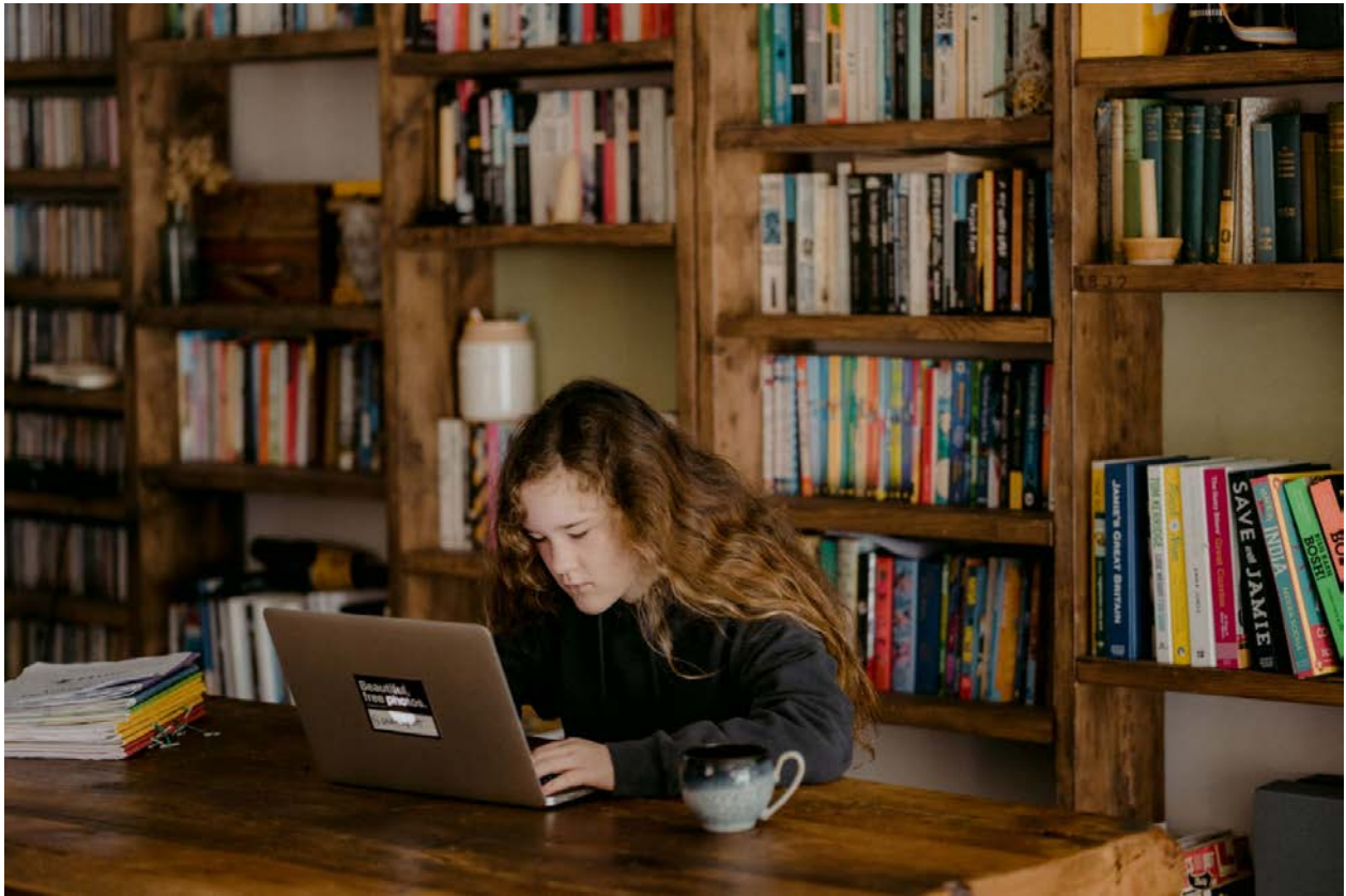
ABOVE Top universities now consider a broader spectrum of qualities when admitting students

However, there has been a shift in perspective over the years, acknowledging that academic results alone are not the sole predictors of success. Top universities now consider a broader spectrum of qualities; this is where UK boarding schools stand out.