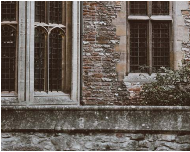
ABOVE 21st-century parents realise that a top-notch degree doesn't guarantee success