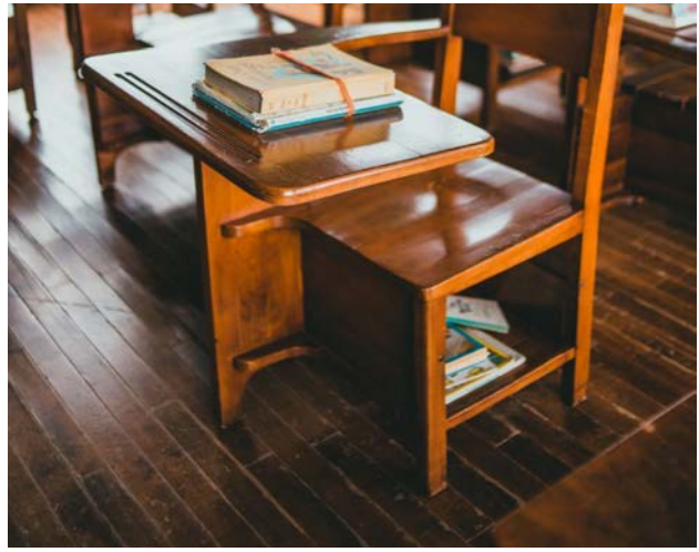
ABOVE UK boarding schools provide an education that goes beyond the ordinary